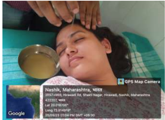
Procedure of Pariseka