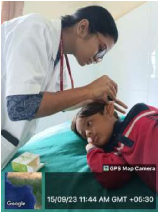
Procedure of Karnapooran

Kamal Nagar, Hirawadi, Panchavati, Nashik - 422 003. | Tel.: (0253) 2621565 (College) | (Hosp.) 2518548 Fax : (0253) 2621638 • E-mail : ssamnsk@gmail.com • website : www.ssam.in