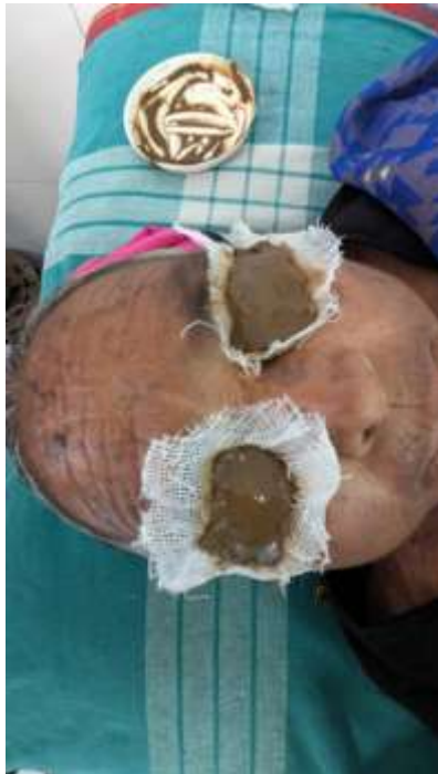
Procedure of Bidalaka