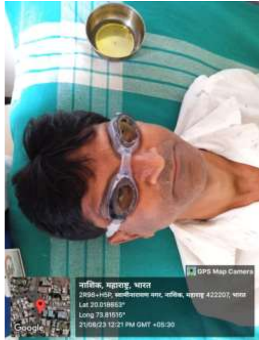
Procedure of Tarpan by Tarpan goggle