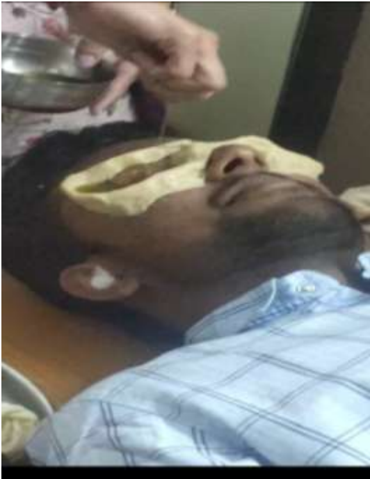
Procedure of Tarpan