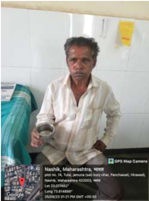
Procedure of Gandusha