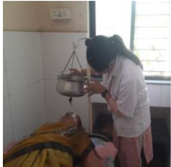
Procedure of Shirodhara