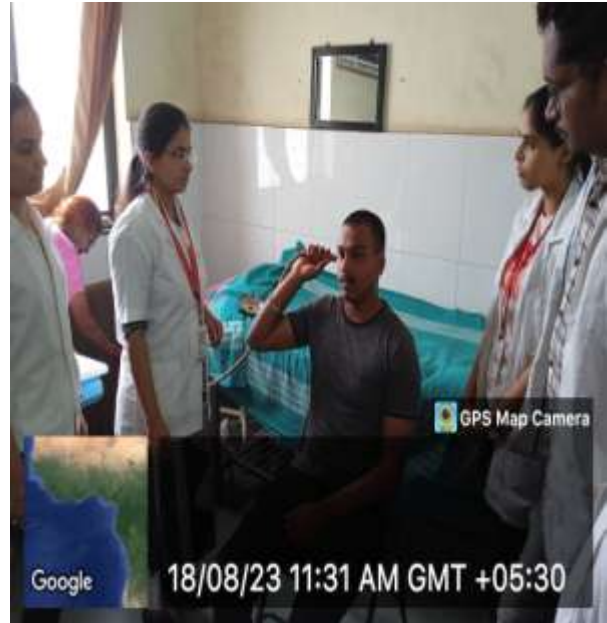
Procedure of Karnadhoopan